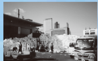
Our recycling system boasts an 80% market share