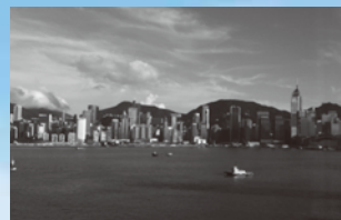
Increased demand prompts expansion of our market overseas