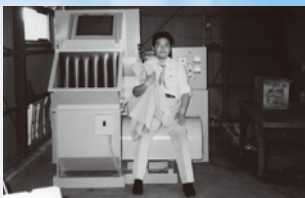
Installation of our first recycling machine at Tsukiji Market

As pioneers in EPS recycling, we will continue to make recycling even more reliable.