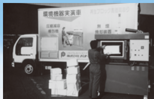
Demonstration of our EPS recycling test vehicle